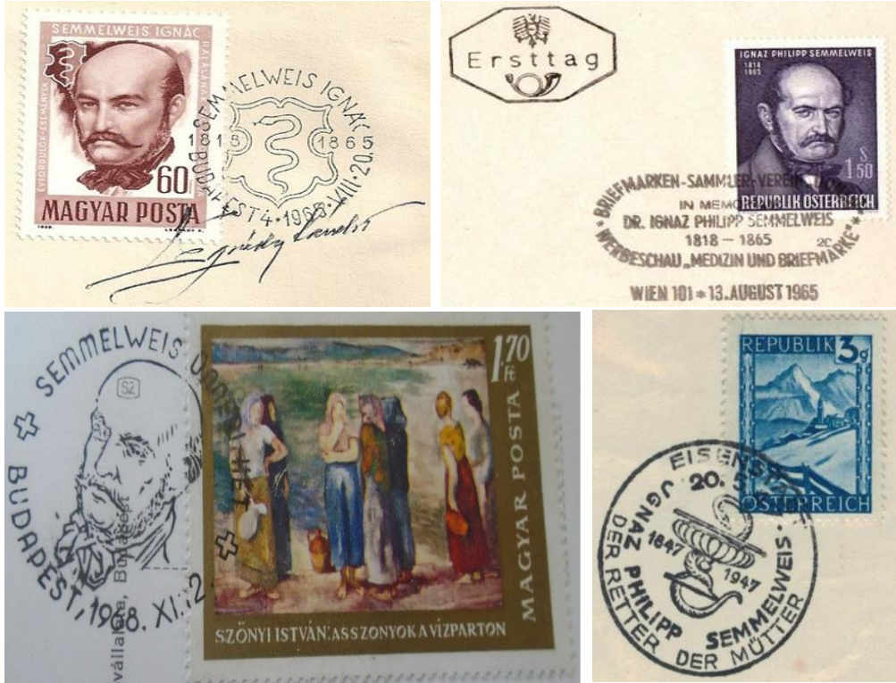
Figure 4. A selection of special postmarks dedicated to the memory of Ignaz Philipp Semmelweis

In conclusion of this article, a small selection of screenshot copies, and special postmarks (almost all, together with postage stamps), thematically dedicated to the memory of Ignaz Philipp Semmelweis, is presented. The first of them is a postage stamp and a thematic postmark, with a facsimile signature of the scientist himself - Ignaz Philipp Semmelweis [6-9].