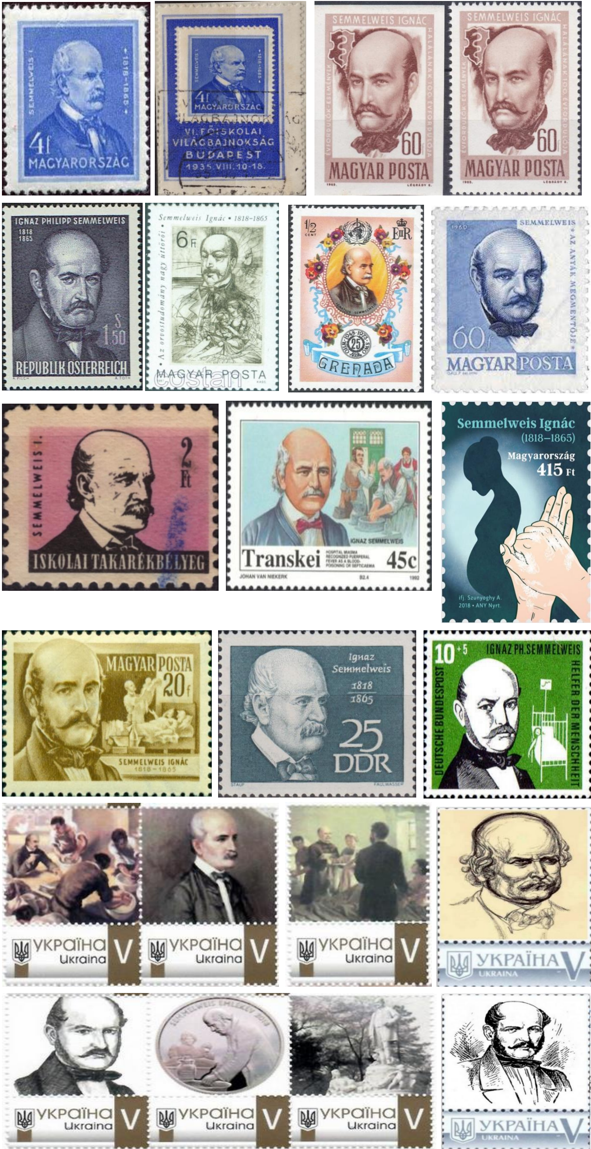
Figure 1. A selection of postage stamps from around the world dedicated to Ignaz Philipp Semmelweis

Naturally, the largest number of postage stamps in memory of I.F. Semmelweis, published in different years and, to coincide with his different biographical events, in the scientist’s homeland - in Hungary and Austria, which, during the scientist’s life, were a single country - the Austro-Hungarian Empire.