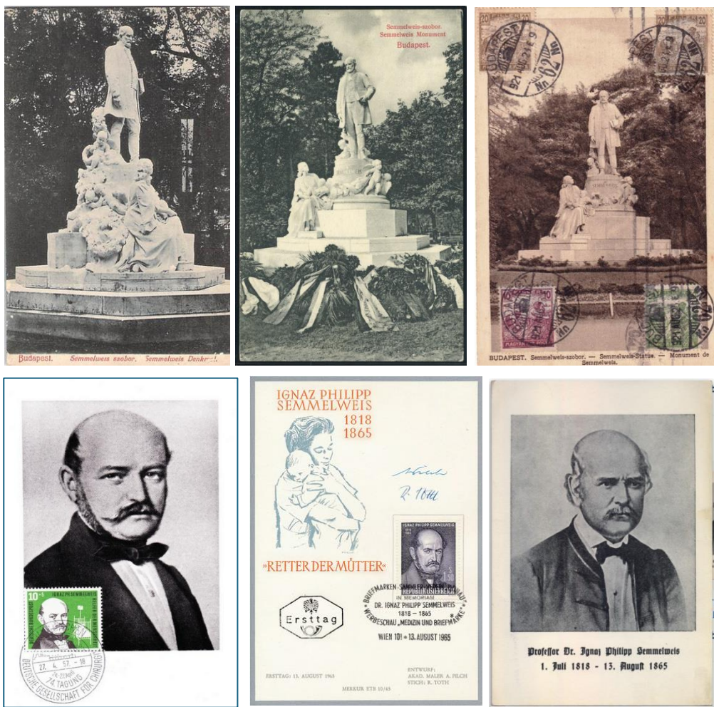
Figure 3. Postcards and card maximums dedicated to the memory of I. F. Semmelweis

Further, in Figure 2, a large thematic selection is presented - 28 first-day envelopes and artistically marked postal envelopes, from a number of countries around the world, dedicated to the memory of Ignaz Philipp Semmelweis [6-9].