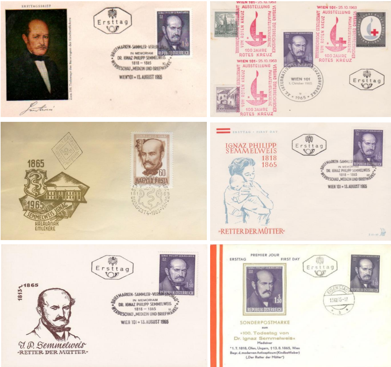
Figure 2. A selection of first-day postal envelopes and artistic marked envelopes dedicated to I.F. Semmelweis